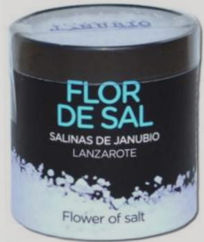
FLOWERS OF SALT FROM JANUVIO