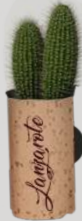
WINE CORK MAGNETS WITH CACTUS