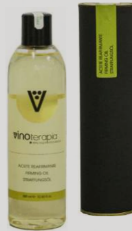
VOLCANIC MALVASIA OIL