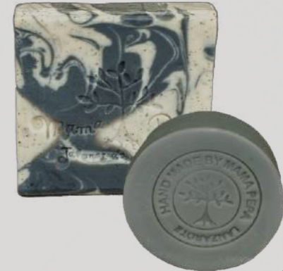
HANDMADE VOLCANIC SAND SOAP